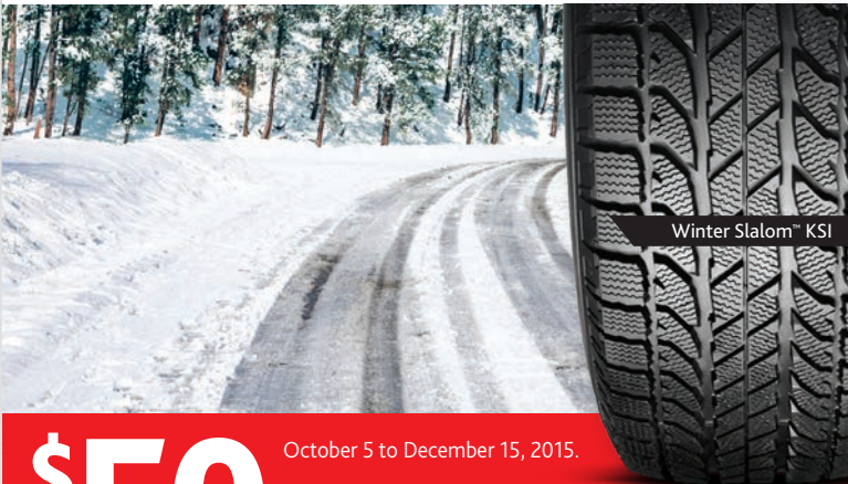
Winter Slalom™ KSI