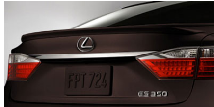
Rear Spoiler $446.00*

Genuine Lexus paint protection film, designed for the hood and front fenders, helps guard your vehicle from weathering, UV radiation and road debris that can chip and scratch the finish. Constructed from durable, nearly invisible thermoplastic urethane, the clear-coated film helps your Lexus maintain a like-new appearance, while allowing you to clean and maintain your vehicle the same as before. Backed by the Lexus 4-year/80,000 km New Vehicle Limited Warranty.