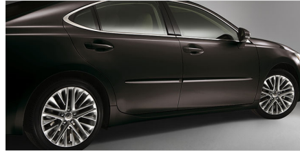
Bodyside Moulding $302.00*

Custom designed for your Lexus providing 400 watts of heating power. Provides easy cold weather starts reducing engine wear. Provides faster interior warm-up. Includes a 'strain relief' electrical cord.