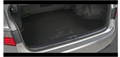
Cargo Liner $134.70*

Stray shopping carts take note. Sleek and amazingly durable, Lexus side mouldings feature a high-quality body-color finish and are rigorously tested for impact and chip resistance in extreme climates. They are also designed to resist peeling in high-pressure washing and normal environmental exposure. By protecting the door from scratches, dents and chipping, this premium accessory helps retain the vehicles resale value.