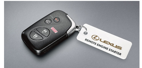
Remote Engine Starter $599.00*

You might like the Lexus spoiler because of its sporty look, which complements the lines of your vehicle's body and is color-keyed to your vehicle. Or because it redirects the air flowing over the roof, using the wind's force to help keep the rear window free of rain, snow, dust and road grime. Whether you're intrigued by its form, function or both, the sturdy polyurethane spoiler makes a beautiful as well as practical addition to your Lexus.