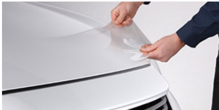
Paint Protection Film $507.00*

This custom-designed Cargo Liner was created specifically to help protect the rear cargo area of your vehicle from dirt, debris, and liquid spills. The Cargo Liner is made of a TPR (Thermo Plastic Rubber) which facilitates loading and unloading. It is also flexible and light so it can be easily lifted for access to storage panels beneath, if applicable.