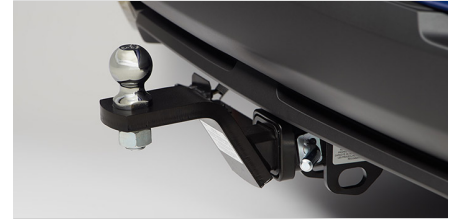
Towing Hitch Ball Platform $124.70*

Please consult your Lexus Owner's Manual before towing.