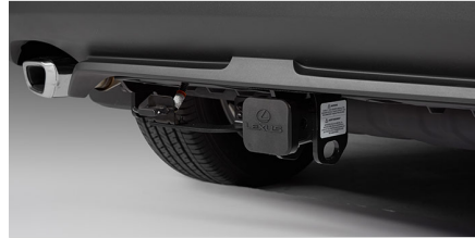
Towing Hitch (2" Receiver), Hitch Plug, and Wire Harness $1,370.57*

These Lexus Side Steps are crafted from anodised aluminium to add some serious style to your NX. Complete with an anti-slip surface for added safety, Lexus Side Steps not only look fantastic but give you that extra convenience when simply getting in and out of your vehicle.