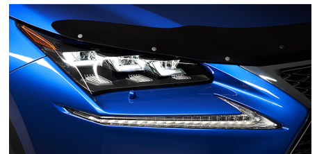
Hood Deflector $193.50*

Stray shopping carts take note. Sleek and amazingly durable, Lexus side mouldings feature a high-quality body-color finish and are rigorously tested for impact and chip resistance in extreme climates. They are also designed to resist peeling in high-pressure washing and normal environmental exposure. By protecting the door from scratches, dents and chipping, this premium accessory helps retain the vehicles resale value.