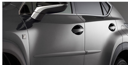
Body Side Moulding $228.50*

Custom designed for your Lexus providing 400 watts of heating power. Provides easy cold weather starts reducing engine wear. Provides faster interior warm-up. Includes a 'strain relief' electrical cord.