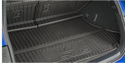
Cargo Liner $170.00*

Custom designed for your Lexus providing 400 watts of heating power. Provides easy cold weather starts reducing engine wear. Provides faster interior warm-up. Includes a 'strain relief' electrical cord.