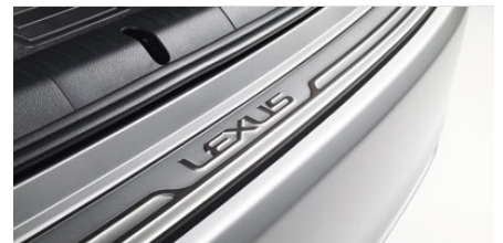
Rear Bumper Protector $224.00*

Genuine Lexus paint protection film, designed for the hood and front fenders, helps guard your vehicle from weathering, UV radiation and road debris that can chip and scratch the finish. Constructed from durable, nearly invisible thermoplastic urethane, the clear-coated film helps your Lexus maintain a like-new appearance, while allowing you to clean and maintain your vehicle the same as before. Backed by the Lexus 4-year/80,000 km New Vehicle Limited Warranty.