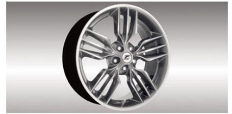
FSPORT 17" Alloy Wheel - Gray (Tires not included) $1,603.00*

FSPORT Sway Bar Kit lets drivers take corners with a flatter stance. Designed for greater control with the existing steering and suspension systems, the durable, high-quality Sway Bar Kit includes chrome moly steel tubing in front, bent to match the natural movement of the CT beam axle, and a high-strength steel bar in the rear. The kit helps improve agility and responsiveness during turn-in and slalom type maneuvers, without adding weight. The striking FSPORT blue powder-coat finish resists corrosion and helps protect against road damage. Higher durometer replacement rubber bushings (included) deflect less at the mount.