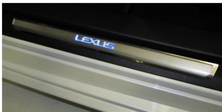
Illuminated Door Sill Protectors $350.00*

The cargo net is designed to help contain and organize everyday items to help ensure they don't shift around or tip over in transit. This unique net features two pouches made from a carbon fibre-like material that are perfect for stowing smaller items. The durable, stain-resistant, elastic-mesh netting attaches to custom-designed hooks and standard D-rings in the rear cargo area. The cargo net can be installed or detached in seconds, and folds flat to be out of the way when not in use.