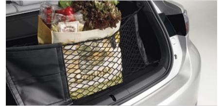
Cargo Net $69.00*

The Cargo Liner provides full protection to the rear cargo area, even when the rear seats are folded down. Featuring an innovative split design, the Cargo Liner provides maximum protection for your cargo area, as well as the back of the rear seats. It also features an anti-slip surface to keep your valuables stable, as well as a raised perimeter lip that helps keep spills limited to the Cargo Liner area.