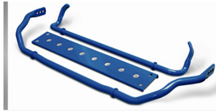
FSPORT Sway Bars $800.00*

FSPORT Lowering Springs offer a more aggressive stance and a lower center of gravity. Installing these springs front and rear sets the vehicle approximately 1-inch closer to the ground. Performance benefits include quicker turn-in and improved steering response and cornering ability. Rigorously tested and engineered, these springs work with either the stock shock absorbers, or the FSPORT Sport Shock Absorber Set. A durable FSPORT blue powder-coat finish provides superior corrosion resistance.