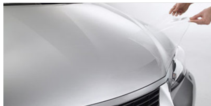
Paint Protection Film $585.00*

Illuminated door sills add a distinguishing element to the vehicle's interior. Injection-molded plastic with a heavy-gauge etched stainless steel overlay helps add protection from scuffs, scrapes and scratches that occur with daily use. Designed to fit the specific contours of the vehicle, front door sills feature a hybrid blue glowing LED illumination of the Lexus name whenever the driver or passenger doors are opened. Rear sills feature an injection-molded base with a stamped stainless steel overlay and polished, debossed Lexus logo. Door sill enhancements are designed to meet Lexus high standards for precision fit and finish for long-lasting beauty and durability.