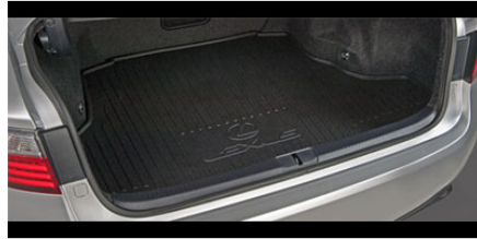
Cargo Liner $135.00*

Custom designed for your Lexus providing 400 watts of heating power. Provides easy cold weather starts reducing engine wear and faster interior warm-up. Includes a 'strain relief' electrical cord.