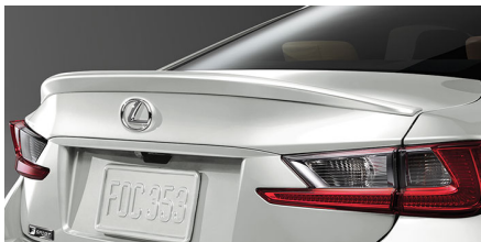
Rear Spoiler $495.00*

Genuine Lexus paint protection film, designed for the hood and front fenders, helps guard your vehicle from weathering, UV radiation and road debris that can chip and scratch the finish. Constructed from durable, nearly invisible thermoplastic urethane, the clear-coated film helps your Lexus maintain a like-new appearance, while allowing you to clean and maintain your vehicle the same as before. Backed by a 7 year limited warranty. At participating dealers only