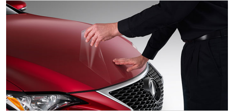
Paint Protection Film $585.00*

Heighten the thrill of stepping into your Lexus with illuminated door sills for the driver and front passenger doors. Precision-contoured to fit the vehicle, the sills feature brushed heavy-gauge stainless steel to help protect against unsightly scuffs, scrapes and scratches. The front door sills feature LED illumination of the Lexus name in glowing white whenever the front doors are opened. These illuminated door sill enhancements are designed to meet Lexus' high standards for precision fit and finish, so you can be assured of long-lasting beauty and durability.