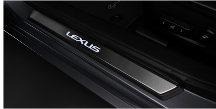
Illuminated Door Sill Protectors $549.00*

Custom designed for your Lexus providing 400 watts of heating power. Provides easy cold weather starts reducing engine wear. Provides faster interior warm-up. Includes a 'strain relief' electrical cord.