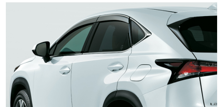
Side Window Deflectors $470.00*

These Lexus Side Steps are crafted from anodised aluminium to add some serious style to your NX. Complete with an anti-slip surface for added safety, Lexus Side Steps not only look fantastic but give you that extra convenience when simply getting in and out of your vehicle.