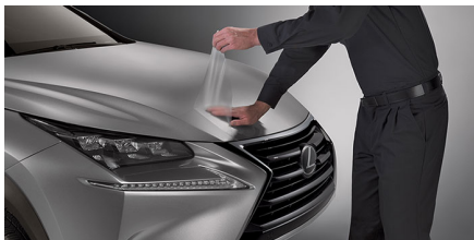
Paint Protection Film $585.00*

Enhance the appearance of your vehicle with this high-strength impact resistant tinted acrylic hood deflector. It's designed for a quality fit and matches the contour of your hood. Aerodynamically designed to deflect airflow over the hood of your vehicle. It helps reduce hood paint chipping from road debris and keeps leading edge of your hood free from insects. Easy to install featuring a 'no-drill' attachment system.