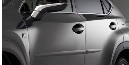
Body Side Moulding $230.00*

Custom designed for your Lexus providing 400 watts of heating power. Provides easy cold weather starts reducing engine wear. Provides faster interior warm-up. Includes a 'strain relief' electrical cord.