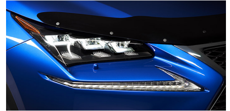
Hood Deflector $195.00*

Sleek and amazingly durable, Lexus body side mouldings feature a high-quality body-color finish and are rigorously tested for impact and chip resistance in extreme climates. They are also designed to resist peeling in high-pressure washing and normal environmental exposure. By protecting the door from scratches, dents and chipping, this premium accessory helps retain the vehicles resale value.