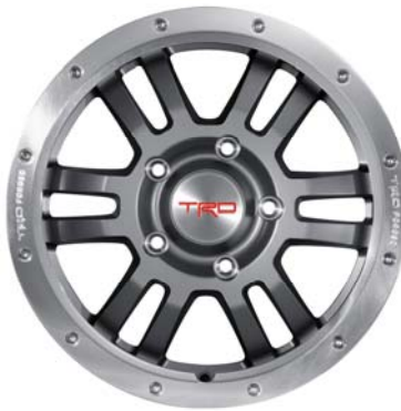
Tundra, Sequoia PTR45 34120 17" x 8 TRD Alloy MSRP* $400.00/wheel