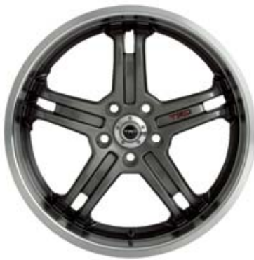
xB Gray: PTR20 52084 / Black: PTR20 52110 19" x 8 TRD Alloy MSRP* Gray: $250.00/wheel MSRP* Black: $300.00/wheel