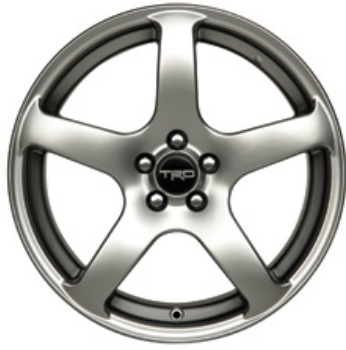
Corolla [2013], Matrix [2013], xD PTR18 21070 18" x 7.5 TRD Alloy MSRP* $275.00/wheel