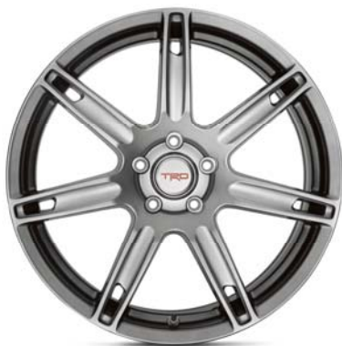
tC PTR56 21110 19" x 8 TRD Alloy MSRP* $250.00/wheel