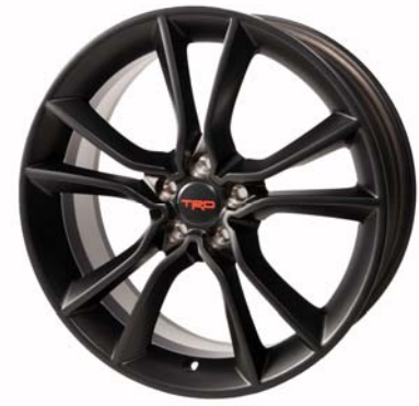
FR-S Front: PTR56 18130 / Rear: PTR56 18131 Front: 18" x 7 / Rear: 18" x 7.5 TRD Alloy MSRP* $290.00/wheel