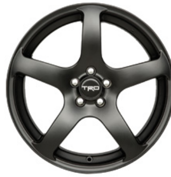
Corolla [2013], Matrix [2013], xD PTR18 21060 18" x 7.5 TRD Alloy MSRP* $275.00/wheel