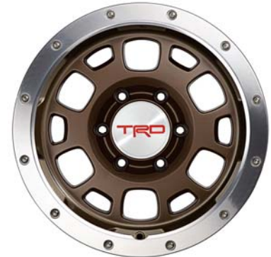
FJ Cruiser, Tacoma PTR18 35090 BR 16" x 7.5 TRD Alloy MSRP* $300.00/wheel