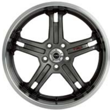
Matrix [2013] PTR20 12080 19" x 8 TRD Alloy MSRP* $300.00/wheel